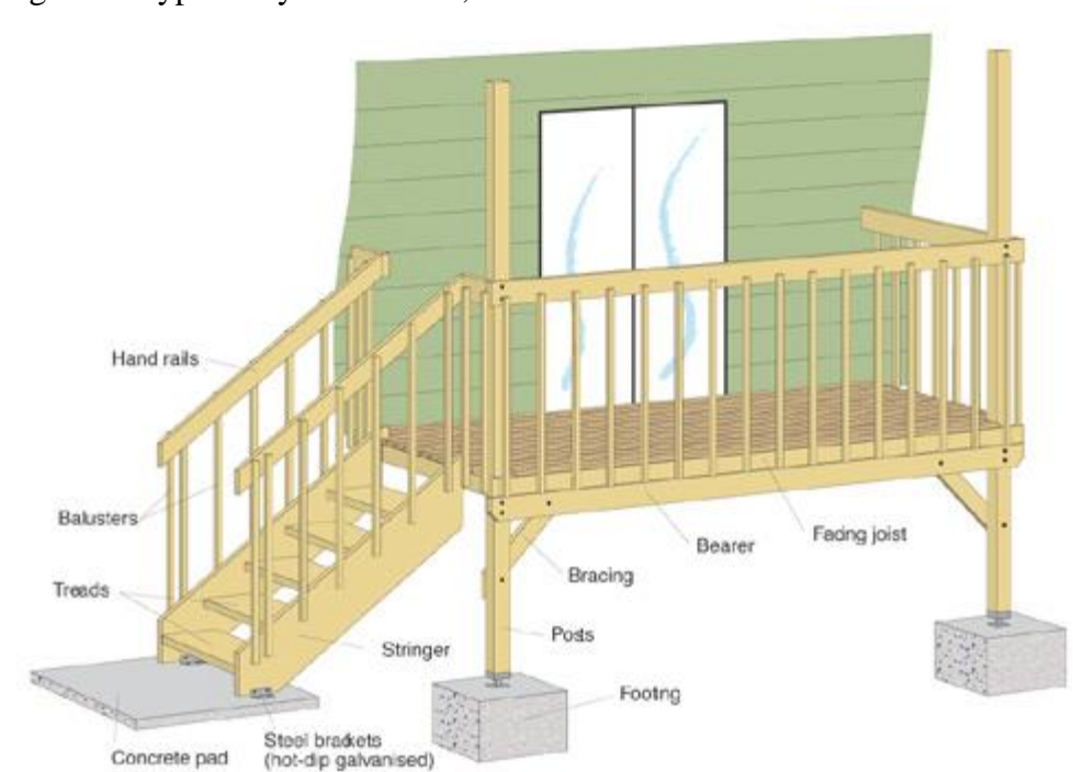
Figure 1: Typical layout of stairs, handrails and balustrades

This application guide includes design issues, span tables and timber sizes for stairs, handrails and balustrades. A typical situation incorporating all three elements is shown in Figure 1.